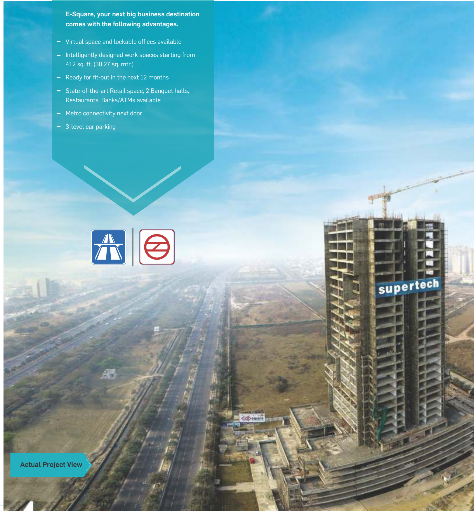
Actual Project View